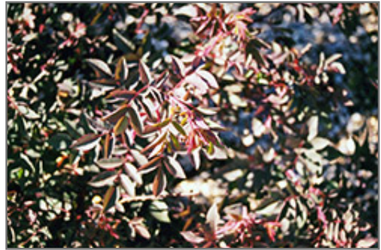
Red Leaf Rose foliage

This shrub should only be grown in full sunlight. It does best in average to evenly moist conditions, but will not tolerate standing water. It is not particular as to soil type or pH. It is highly tolerant of urban pollution and will even thrive in inner city environments. This species is not originally from North America.