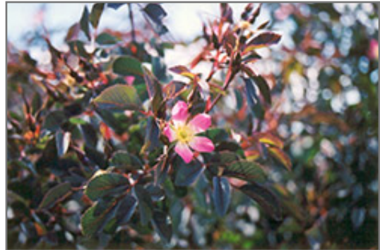
Red Leaf Rose flowers