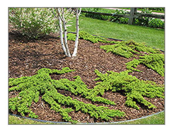
Dwarf Japgarden Juniper

This is a relatively low maintenance shrub, and is best pruned in late winter once the threat of extreme cold has passed. Deer don't particularly care for this plant and will usually leave it alone in favor of tastier treats. It has no significant negative characteristics.