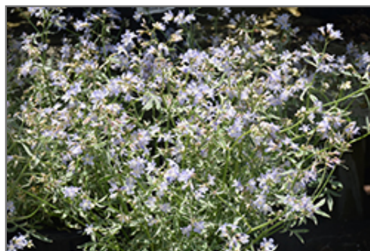
Touch Of Class Jacob's Ladder flowers