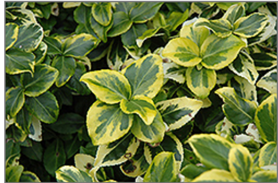
Gold Prince Wintercreeper foliage