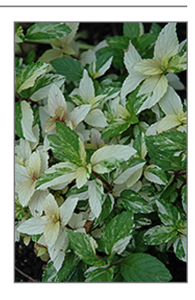
Variegated Peppermint foliage

Aside from its primary use as an edible, Variegated Peppermint is sutiable for the following landscape applications;