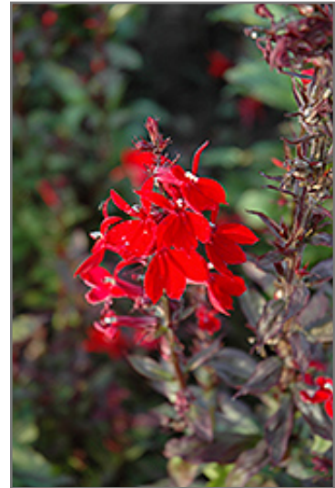
Queen Victoria Lobelia flowers