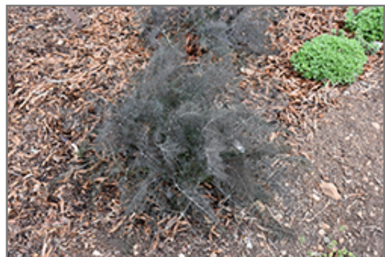
Bronze Fennel