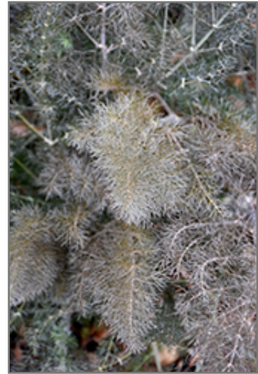
Bronze Fennel foliage

This is an herbaceous perennial herb with tall flower stalks held atop a low mound of foliage. It brings an extremely fine and delicate texture to the garden composition and should be used to full effect. This plant will require occasional maintenance and upkeep, and is best cleaned up in early spring before it resumes active growth for the season. It is a good choice for attracting butterflies to your yard. Gardeners should be aware of the following characteristic(s) that may warrant special consideration;