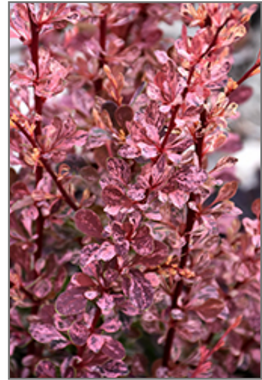
Rose Glow Japanese Barberry foliage

Rose Glow Japanese Barberry is recommended for the following landscape applications;