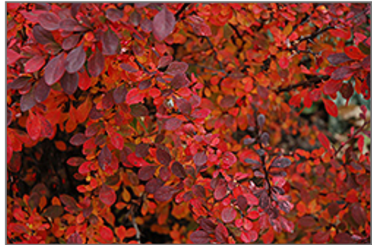
Rose Glow Japanese Barberry in fall

This shrub does best in full sun to partial shade. It is very adaptable to both dry and moist growing conditions, but will not tolerate any standing water. It is considered to be drought-tolerant, and thus makes an ideal choice for xeriscaping or the moisture-conserving landscape. It is not particular as to soil type or pH, and is able to handle environmental salt. It is highly tolerant of urban pollution and will even thrive in inner city environments. This is a selected variety of a species not originally from North America.