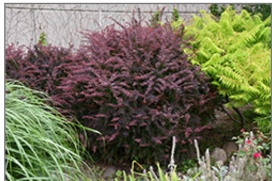
Rose Glow Japanese Barberry