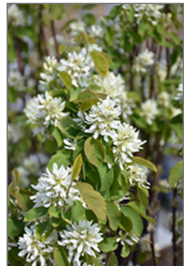
Thiessen Saskatoon flowers