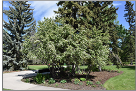
Thiessen Saskatoon

Thiessen Saskatoon is clothed in stunning clusters of white flowers rising above the foliage from early to mid spring before the leaves. It has dark green deciduous foliage. The oval leaves turn an outstanding yellow in the fall. It features an abundance of magnificent blue berries in late spring.