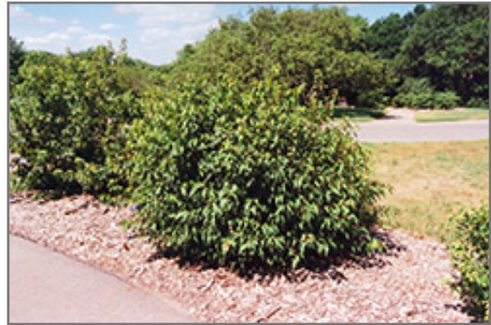
Bailey Compact Amur Maple

This shrub does best in full sun to partial shade. It is very adaptable to both dry and moist growing conditions, but will not tolerate any standing water. It is not particular as to soil type or pH. It is highly tolerant of urban pollution and will even thrive in inner city environments. This is a selected variety of a species not originally from North America.