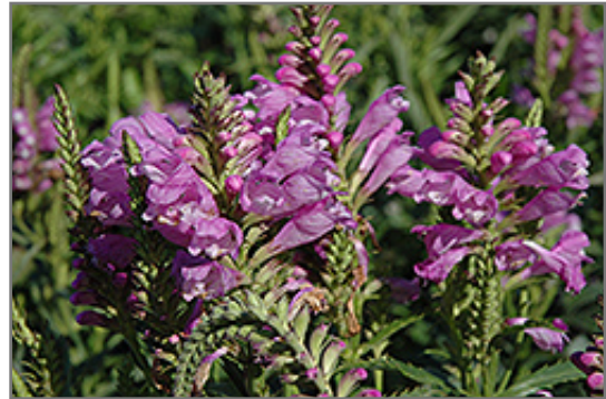
Vivid Obedient Plant flowers