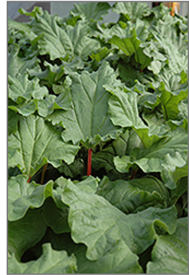
Canada Red Rhubarb

Aside from its primary use as an edible, Canada Red Rhubarb is suitable for the following landscape applications;