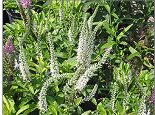
Dwarf Alpine Speedwell flowers