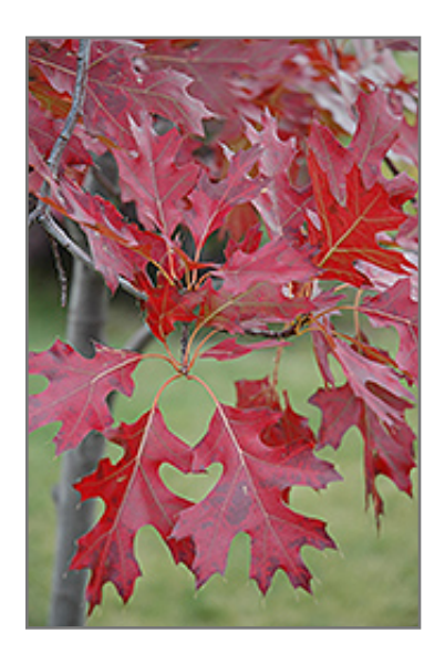
Northern Pin Oak in fall