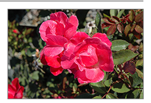
Pink Knock Out Rose flowers

The blooms on this hardy shrub are individually small but are in such big clusters the visual impact is stunning; beginning in spring and continuing throughout the summer and fall, even to the first frost, this shrub will deliver glorious color