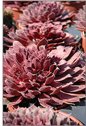
Royal Ruby Hens And Chicks

Royal Ruby Hens And Chicks is recommended for the following landscape applications;