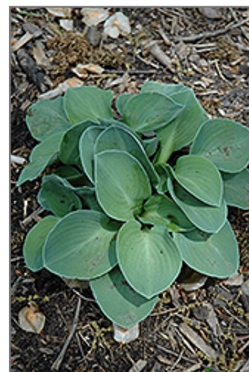
Blue Mouse Ears Hosta