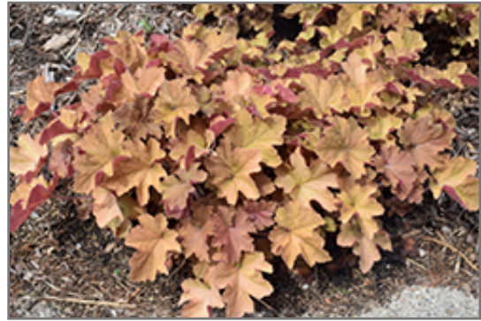
Caramel Coral Bells

Caramel Coral Bells will grow to be about 10 inches tall at maturity extending to 18 inches tall with the flowers, with a spread of 18 inches. When grown in masses or used as a bedding plant, individual plants should be spaced approximately 15 inches apart. Its foliage tends to remain low and dense right to the ground. It grows at a medium rate, and under ideal conditions can be expected to live for approximately 10 years. As an evergreen perennial, this plant will typically keep its form and foliage year-round.