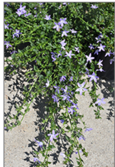
Blue Waterfall Serbian Bellflower in bloom