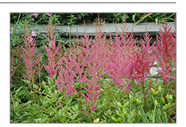
Visions in Pink Chinese Astilbe flowers