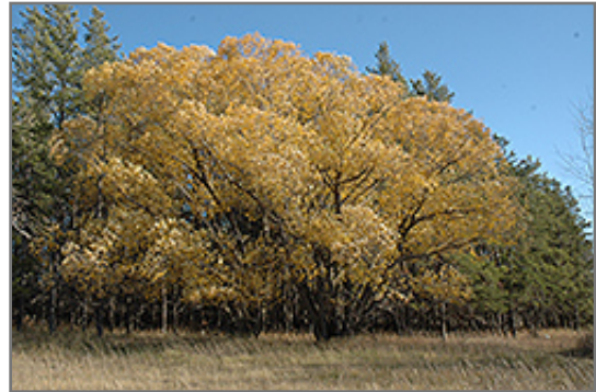
White Willow in fall