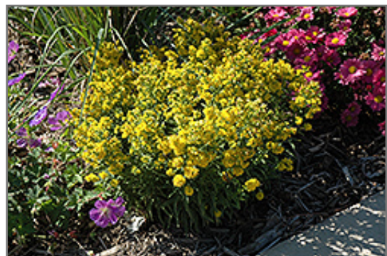
Goldrush Goldenrod in bloom