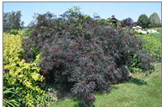
Black Lace Elder