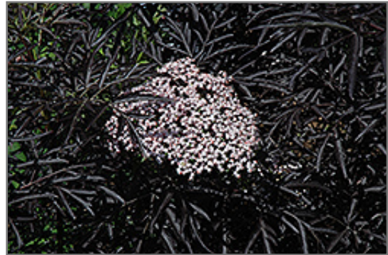
Black Lace Elder flowers