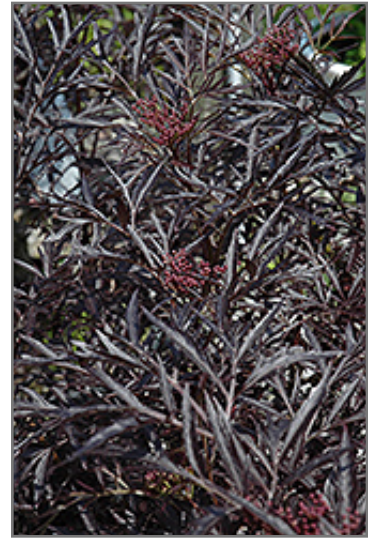
Black Lace Elder flowers

This plant is not reliably hardy in our region, and certain restrictions may apply; contact the store for more information.