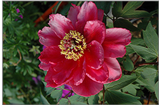
Shimanishiki Tree Peony flowers

A beautiful woody peony for the garden collector, with bold flowers in a rich reddish-purple with prominent streaks of white in spring, great as an accent in the garden; unlike perennial peonies, remember not to prune this variety