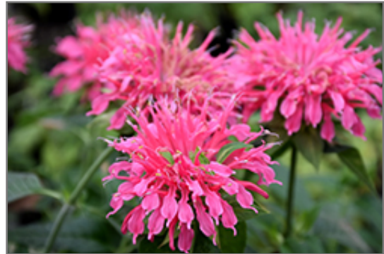
Coral Reef Beebalm flowers