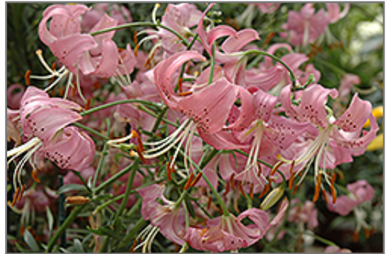
Pink Tiger Lily flowers