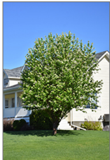
Amur Cherry