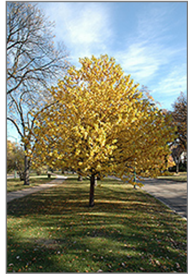
Amur Cherry in fall

This tree should only be grown in full sunlight. It does best in average to evenly moist conditions, but will not tolerate standing water. It is not particular as to soil type or pH. It is somewhat tolerant of urban pollution. This species is not originally from North America.