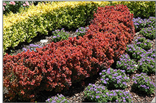
Royal Burgundy Japanese Barberry

Royal Burgundy Japanese Barberry will grow to be about 24 inches tall at maturity, with a spread of 3 feet. It tends to fill out right to the ground and therefore doesn't necessarily require facer plants in front. It grows at a medium rate, and under ideal conditions can be expected to live for approximately 20 years.