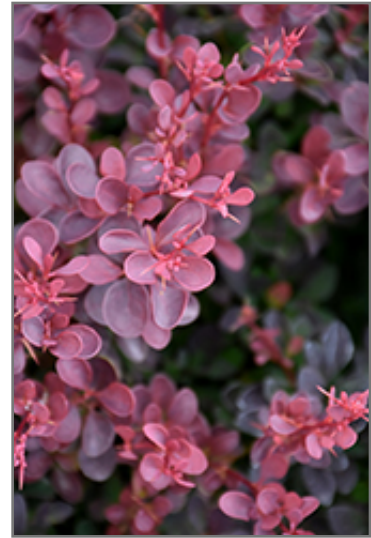
Royal Burgundy Japanese Barberry foliage

Royal Burgundy Japanese Barberry is recommended for the following landscape applications;