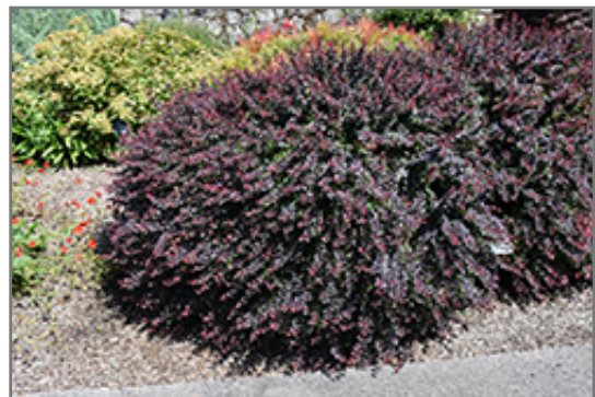
Royal Burgundy Japanese Barberry