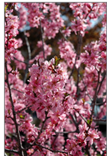
Muckle Plum (tree form) flowers