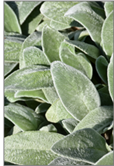
Lamb's Ears foliage

Lamb's Ears is recommended for the following landscape applications;