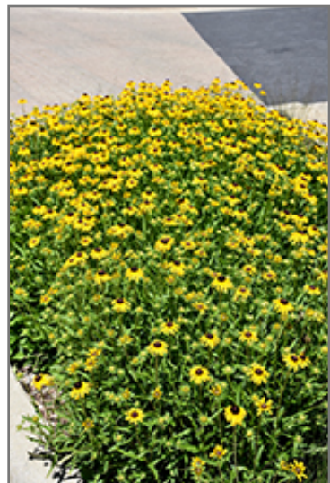
Viette's Little Suzy Coneflower in bloom