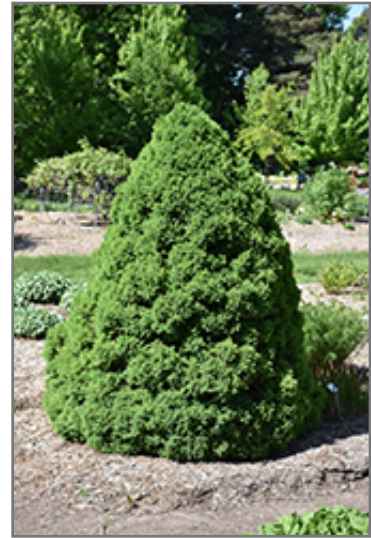
Dwarf Alberta Spruce

Dwarf Alberta Spruce will grow to be about 6 feet tall at maturity, with a spread of 5 feet. It tends to fill out right to the ground and therefore doesn't necessarily require facer plants in front, and is suitable for planting under power lines. It grows at a slow rate, and under ideal conditions can be expected to live for 50 years or more.