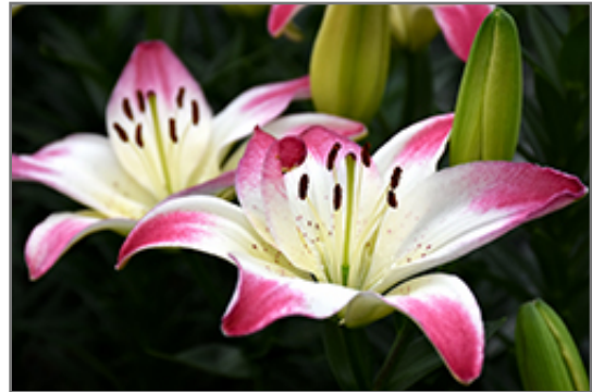
Lollypop Lily flowers

Lollypop Lily will grow to be about 20 inches tall at maturity, with a spread of 12 inches. When grown in masses or used as a bedding plant, individual plants should be spaced approximately 10 inches apart. It grows at a fast rate, and under ideal conditions can be expected to live for approximately 10 years. As an herbaceous perennial, this plant will usually die back to the crown each winter, and will regrow from the base each spring. Be careful not to disturb the crown in late winter when it may not be readily seen!