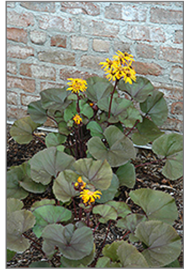
Britt Marie Crawford Rayflower in bloom