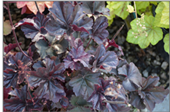
Obsidian Coral Bells foliage