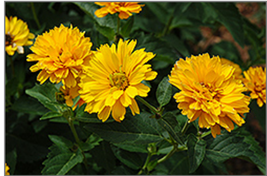
Summer Sun False Sunflower flowers

Summer Sun False Sunflower is recommended for the following landscape applications;