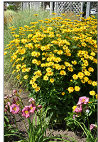
Summer Sun False Sunflower in bloom