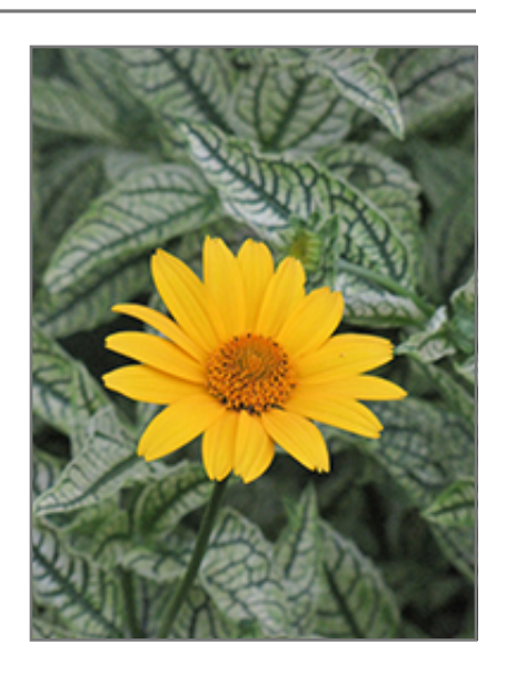
Loraine Sunshine False Sunflower flowers