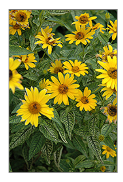
Loraine Sunshine False Sunflower flowers