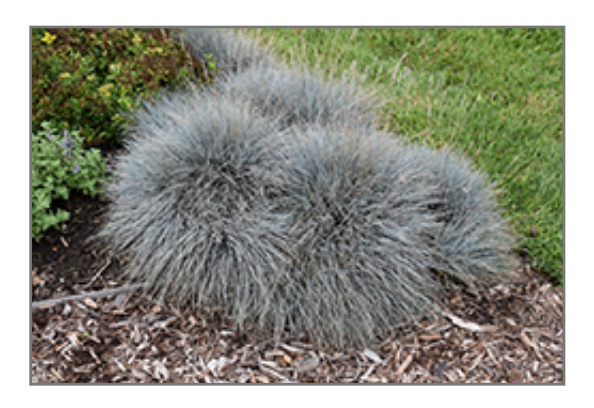
Elijah Blue Fescue

This plant does best in full sun to partial shade. It prefers to grow in average to dry locations, and dislikes excessive moisture. It is considered to be drought-tolerant, and thus makes an ideal choice for a low-water garden or xeriscape application. It is not particular as to soil type or pH. It is highly tolerant of urban pollution and will even thrive in inner city environments. This is a selected variety of a species not originally from North America. It can be propagated by division; however, as a cultivated variety, be aware that it may be subject to certain restrictions or prohibitions on propagation.