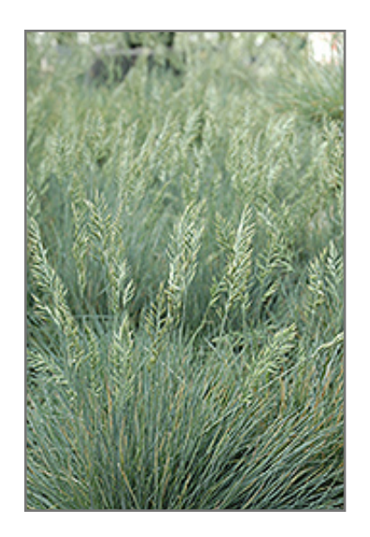
Elijah Blue Fescue foliage

232 Range Road P.O. Box 3093 Sherwood Park, AB, T8H 2T1 phone: 780-467-5743 info@salisburygreenhouse.com www.salisburygreenhouse.com