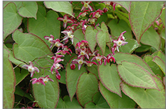
Bishop's Hat flowers

This plant will require occasional maintenance and upkeep, and is best cleaned up in early spring before it resumes active growth for the season. It is a good choice for attracting bees to your yard, but is not particularly attractive to deer who tend to leave it alone in favor of tastier treats. Gardeners should be aware of the following characteristic(s) that may warrant special consideration;