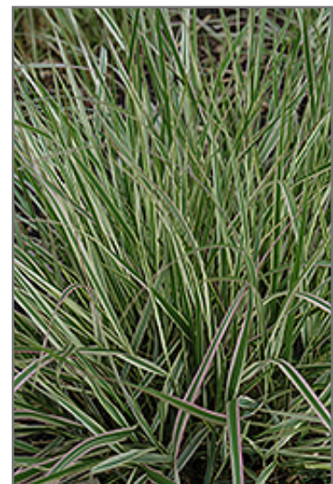
Variegated Reed Grass foliage