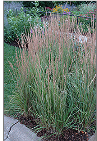
Variegated Reed Grass in bloom

Variegated Reed Grass is recommended for the following landscape applications;