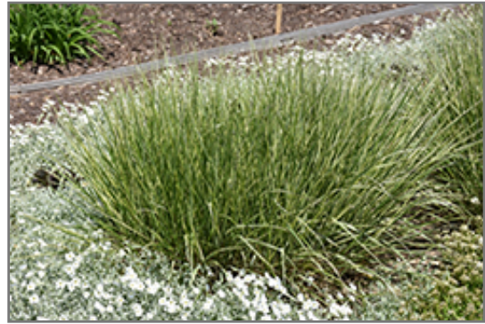
Variegated Reed Grass

Variegated Reed Grass will grow to be about 3 feet tall at maturity extending to 4 feet tall with the flowers, with a spread of 24 inches. It tends to be leggy, with a typical clearance of 1 foot from the ground, and should be underplanted with lower-growing perennials. It grows at a medium rate, and under ideal conditions can be expected to live for approximately 10 years. As an herbaceous perennial, this plant will usually die back to the crown each winter, and will regrow from the base each spring. Be careful not to disturb the crown in late winter when it may not be readily seen!