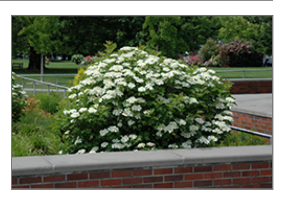
Bailey Compact Highbush Cranberry in bloom

Bailey Compact Highbush Cranberry is a dense multi-stemmed deciduous shrub with an upright spreading habit of growth. Its average texture blends into the landscape, but can be balanced by one or two finer or coarser trees or shrubs for an effective composition.