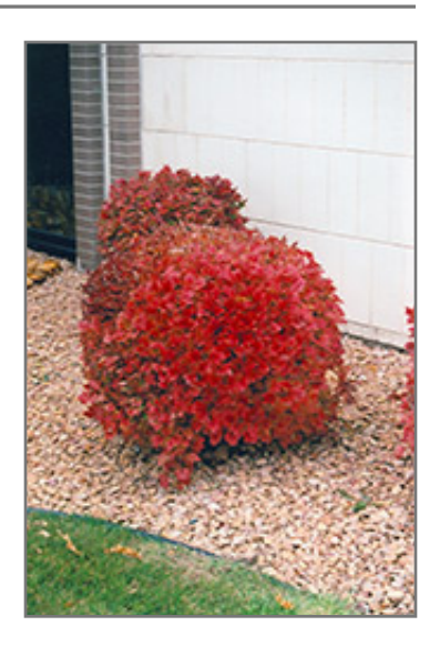
Bailey Compact Highbush Cranberry in fall

232 Range Road P.O. Box 3093 Sherwood Park, AB, T8H 2T1 phone: 780-467-5743 info@salisburygreenhouse.com www.salisburygreenhouse.com