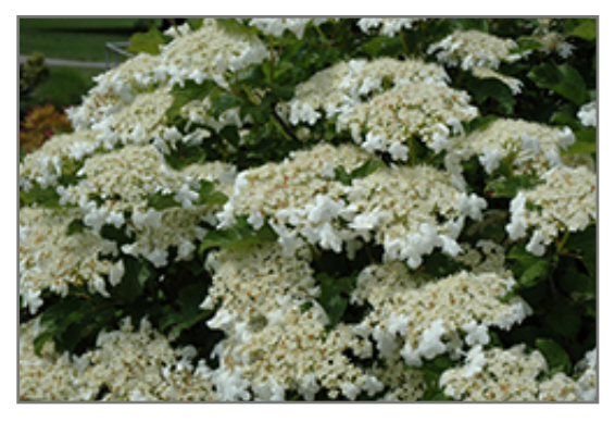
Bailey Compact Highbush Cranberry flowers