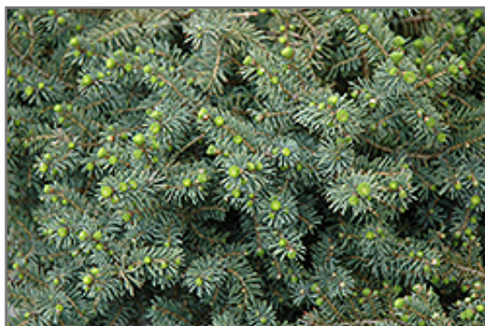
Dwarf Black Spruce foliage