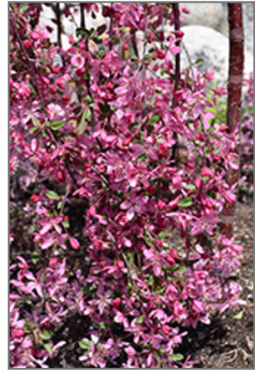
Royal Beauty Flowering Crab flowers