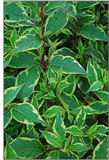
Golden Variegated Dogwood foliage