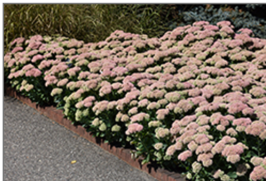
Autumn Joy Stonecrop in bloom