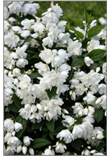
Snowbelle Mockorange flowers