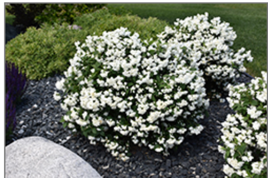
Snowbelle Mockorange in bloom