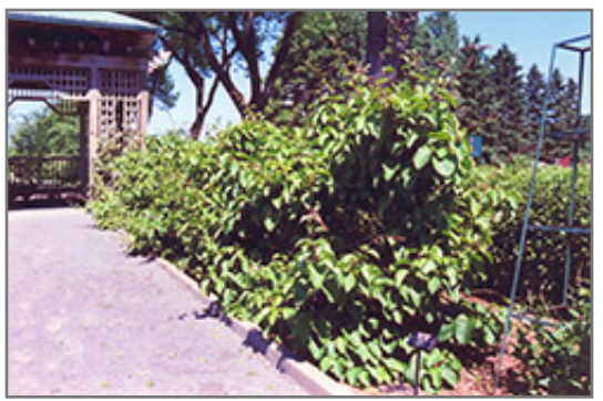
Issai Hardy Kiwi

232 Range Road P.O. Box 3093 Sherwood Park, AB, T8H 2T1 phone: 780-467-5743 info@salisburygreenhouse.com www.salisburygreenhouse.com