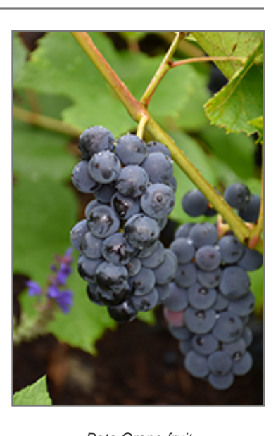
Beta Grape fruit

Aside from its primary use as an edible, Beta Grape is sutiable for the following landscape applications;