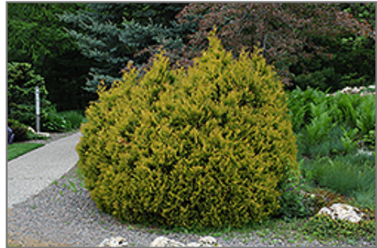
Rheingold Arborvitae

Rheingold Arborvitae will grow to be about 5 feet tall at maturity, with a spread of 4 feet. It tends to fill out right to the ground and therefore doesn't necessarily require facer plants in front, and is suitable for planting under power lines. It grows at a slow rate, and under ideal conditions can be expected to live for approximately 30 years.