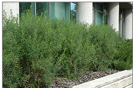
Dwarf Turkestan Burning Bush