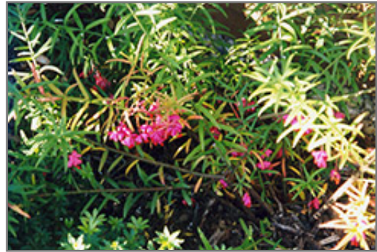
Dwarf Turkestan Burning Bush flowers

This shrub performs well in both full sun and full shade. It is very adaptable to both dry and moist locations, and should do just fine under typical garden conditions. It is not particular as to soil type or pH. It is highly tolerant of urban pollution and will even thrive in inner city environments. This is a selected variety of a species not originally from North America.